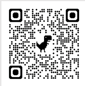
QR Code for Online Registration

Pay Online at https://account.venmo.com/u/CFL_PresbyterianWomen