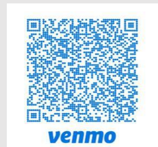
QR Code for Online Payment